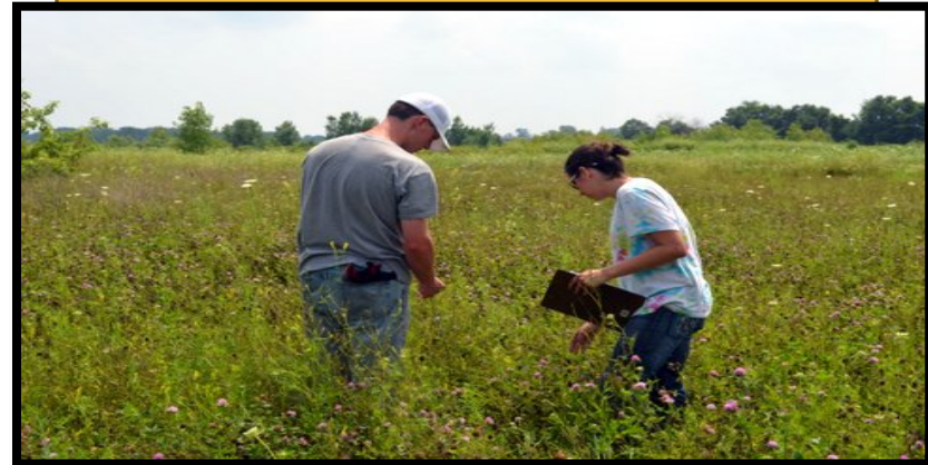
Plant Surveying at Sylvan Prairie Park