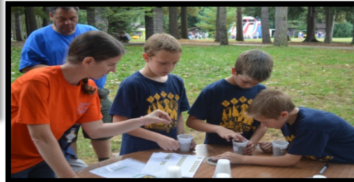
Planting native seed for Cub Scouts to grow and re-plant at Camp Miakonda