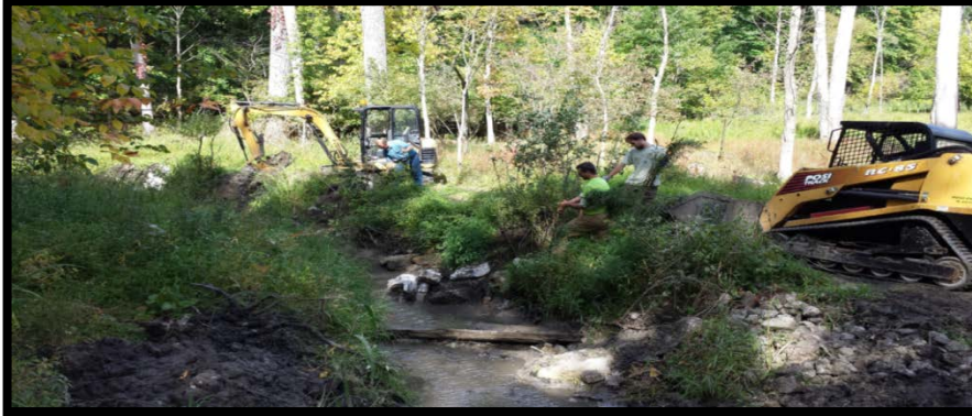
Improving erosion control in Hartman Ditch with mini-Bendway Weirs and plantings