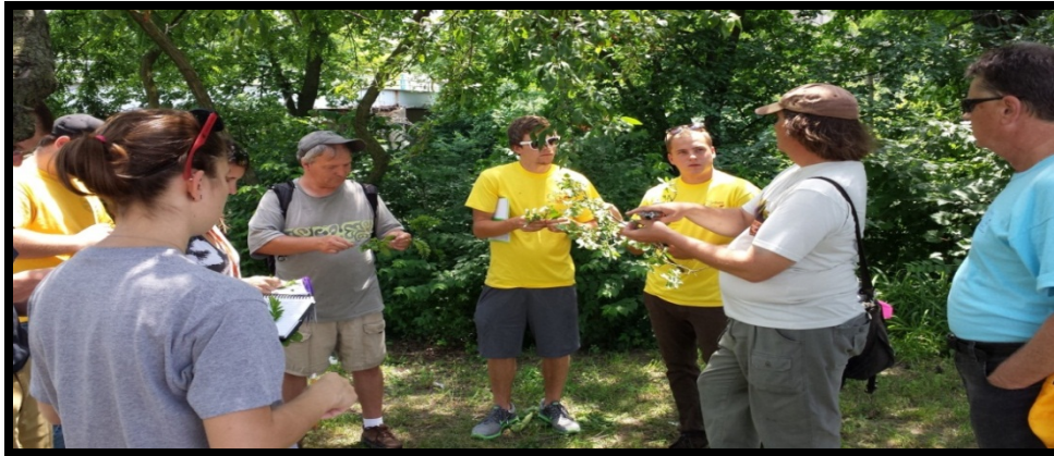
Training with professionals before work began

8 PCS interns spent the summer improving the Ottawa River at The University of Toledo, The Olander Park System, and Camp Miakonda