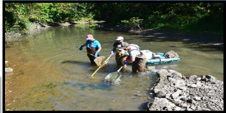
Post-project monitoring with EnviroScience